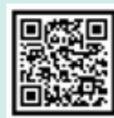
GMAF 2024 Website