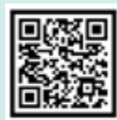
GMAF 2024 Program Book

* This forum provides simultaneous interpretation services in Korean and English.